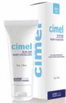
cimel™ DRY SKIN REPAIR