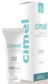
cimel™ CLARIFYING CREAM